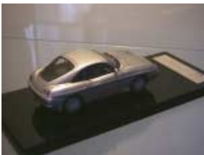
ABC Brianza FIAT barchetta Coupé

Limited edition 1/43 model of the Maggiora prototype Coupe barchetta.